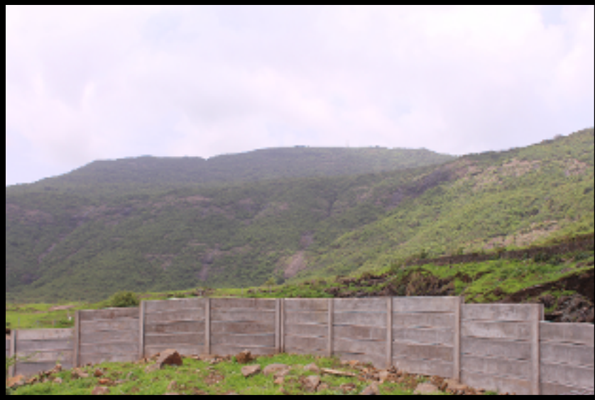
6FT walls all around the Project