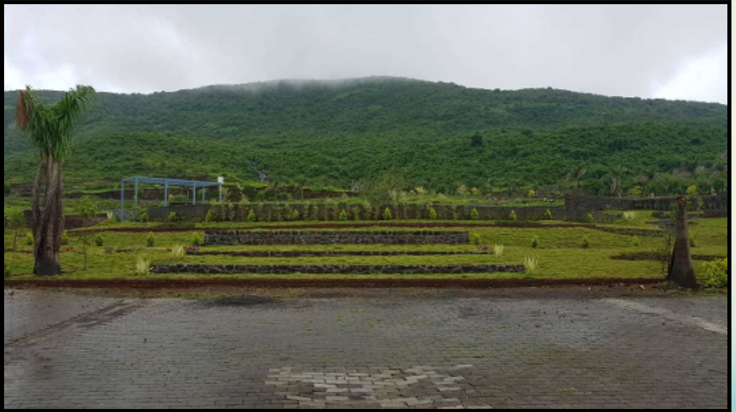
Grand Entrance and Wide Internal Roads overlooking the natural waterfalls.